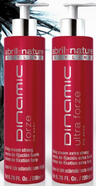
DINAMIC DINAMIC force ultra force

HAIR CARE: Double action of the fixatives components: fixatives + hair conditioners. Hair moisturizing, restoration and softness. Increase in hair fibre thickness.