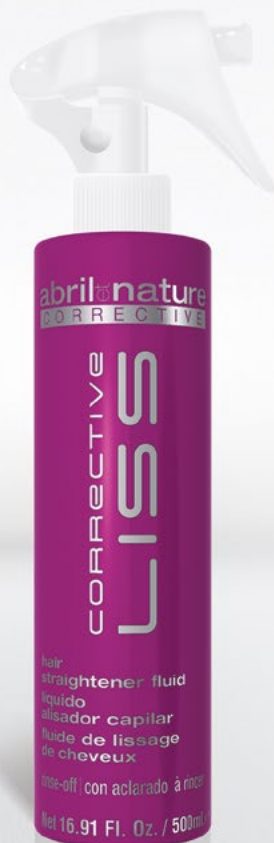
CORRECTIVE LISS hair straightening fluid

Hair straightening in a natural way. Ease to comb. Volume control and frizz reduction. Shine and natural look. Silky feel. Anti-oxidant and anti-ageing action.