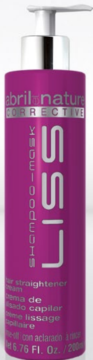
SHampoo-mask LISS wash, dry and iron